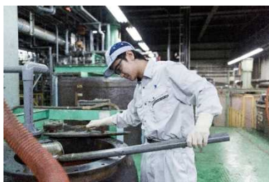
Lithium cobalt oxide being processed

Exploiting the infinite potential of rare earth elements