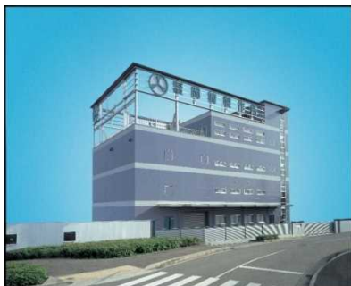
Aerospace Division in the Main Manufacturing Factory

Temperature sensors supporting space development both in Japan and around the world