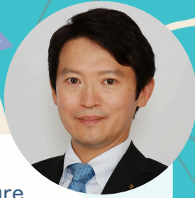
SAITO Motohiko, Governor of Hyogo Prefecture

Born in Kobe City, Hyogo Prefecture in 1977. After graduating from the University of Tokyo, he joined the Ministry of Internal Affairs and Communications. In addition to his work within the ministry, he has experienced working at various local governments, such as Sado City in Niigata Prefecture, Iitate Village in Fukushima Prefecture, Miyagi Prefecture, and Osaka Prefecture. In August 2021, he became the 53rd Governor of Hyogo Prefecture.